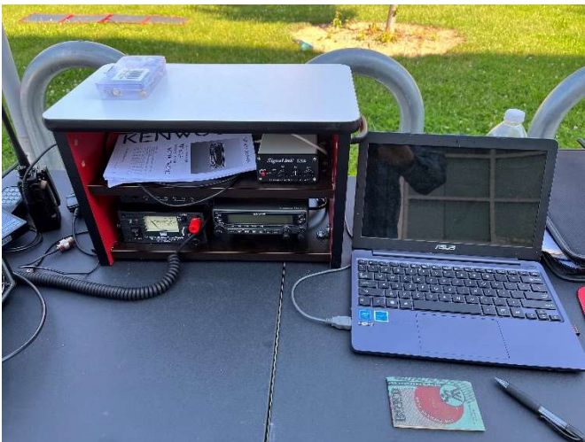
WA3ARC Red Cross VHF Station at Shippensburg