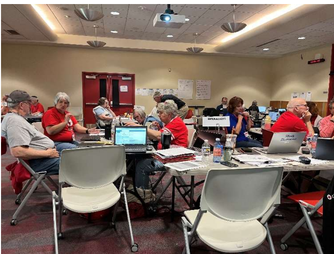
Red Cross HQ Operations Room